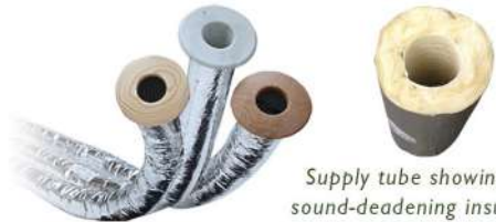
Supply tube showing its sound-deadening insulation

The Unico System Supply Outlets provide quiet delivery of high velocity air to the conditioned space. Unico outlets come in 2" round and 1 1/2" x 8" slotted and are available in a variety of colors and materials.