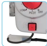
Integrated Piezo Igniter