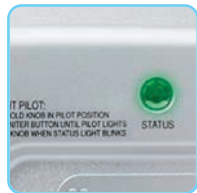
Gas Control Valve with Exclusive GREEN LED Indicator