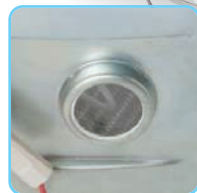
Sight Window to Combustion Chamber